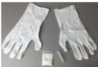
Cotton gloves, tubing coupler, cornstarch packet

Each box comes with Handy-Lok closure, a tubing coupler, 1 pair of cotton gloves and packet of cornstarch.