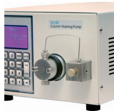
HPLC PUMP MODEL TF-100