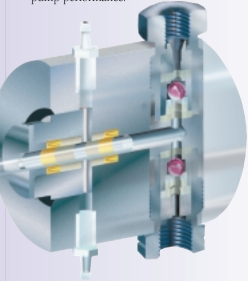
Reproducible metering and corrosion resistant materials

Extended flow rate ranges are possible by using up to three interchangable liquid end assemblies. Software control of refill rates and compressibility compensation add to the versatility of the Optos Series pumps and enhance pump performance.